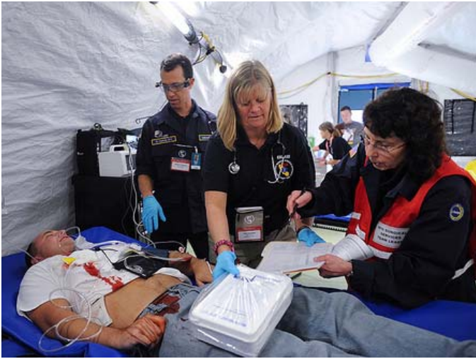
The Emergency Medical Services Authority hosted the Golden Guardian 2012 Disaster Medical Response Exercise at Sac State June 6, 2012.