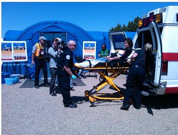
The Emergency Medical Services Authority hosted the Golden Guardian 2012 Disaster Medical Response Exercise at Sac State June 6, 2012.