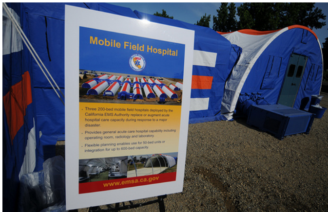
The Emergency Medical Services Authority hosted the Golden Guardian 2012 Disaster Medical Response Exercise at Sac State June 6, 2012.