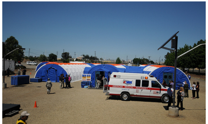
The Emergency Medical Services Authority hosted the Golden Guardian 2012 Disaster Medical Response Exercise at Sac State June 6, 2012.